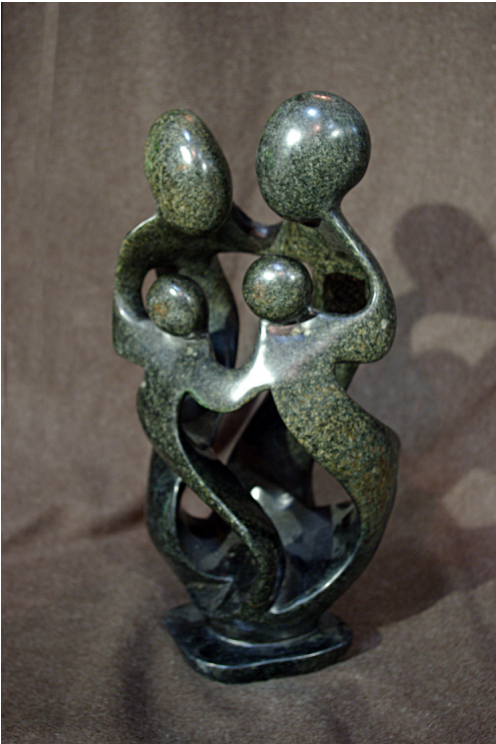
Family of Four Zimbabwe Stone Sculpture